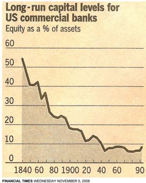
Figure 4 - In 1840 banks lent out only about 2 times their equity while in the more recent period it has ranged from ten to sixteen times (corresponding to 6 to 10 percent on the graph). Bear Stearns and Lehman were at more than 30 to 1 when they failed although they were in a riskier business than commercial banks.

mortgage market, the 2004 repeal of the Net Capital Rule for the largest investment banks 24 which permitted debt/equity leverage to grow at failure to over 30-to-1 for Bear Stearns and Lehman Brothers as well as the end of the uptick rule for short selling. 25 So much for control of margining, so much for control on short selling: the great market reforms from the 1929 Crash and the subsequent Great Depression were now largely just history. Figure 4 shows the ratio of bank equity to assets since 1840. 26