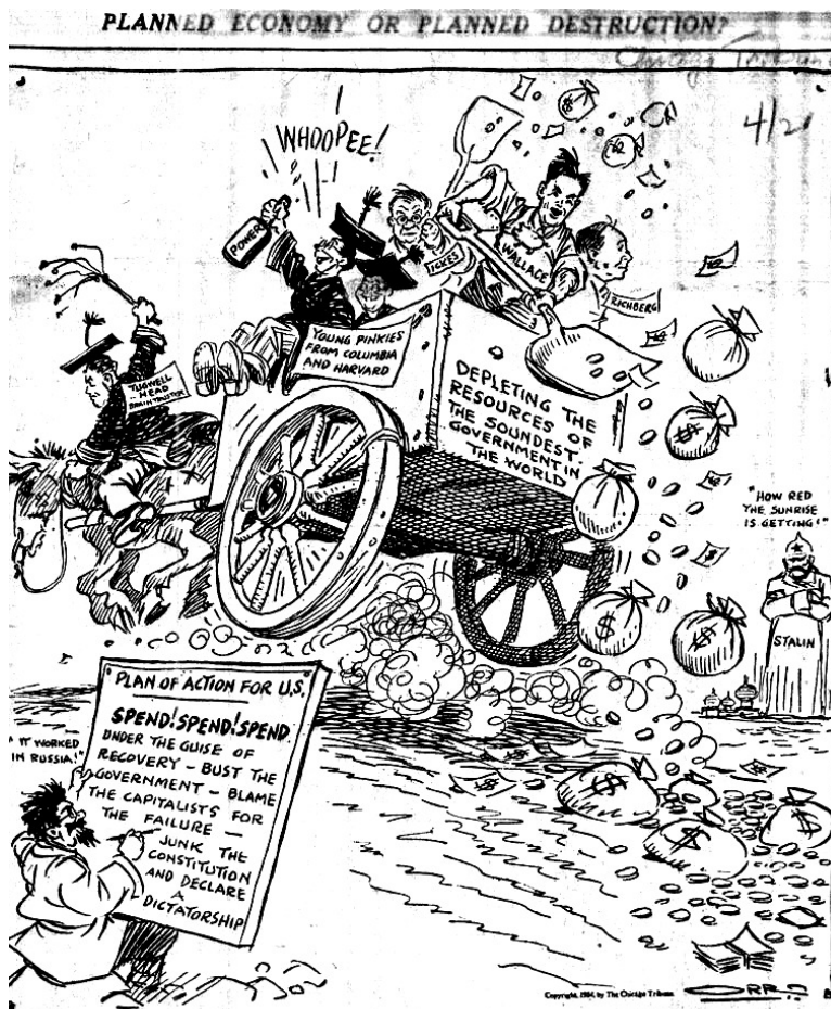
Figure 3 - The cartoonist has captured the sentiments of many Americans both now and then although the names have changed as well as the xenophobia toward communism which was an issue in 1934 when 25% of America was out of work. Communist still exists and a fear of the power of China--not the U.S.S.R.--still exists although it is their economic power and not their military might that impresses us now. Today it is the “poor” nations that lend to the “rich”.

Victor in a tragically divided election, George W. Bush came to office believing that lower taxes would result in greater government revenues as an article of faith. It was Laffer redux--without strong evidence that the tax reductions of the Reagan era had not already pushed the tax rate to the lower portion of the Laffer curve where reduced tax rates lower government revenues. In fact, the Bush reductions appear to have done just that as 2003 and 2004 “on-budget” revenue shortfalls produced the greatest government deficits in world history (more than 1/2 trillion dollars each year) and have stubbornly persisted in that area without counting the “off-budget” war in Iraq . 22 This was, of course, before the events of 2008/9 where further extraordinary expenditures have been made in the Troubled Asset Relief Program (TARP) program to save the banks and other financial institutions. See Figure 3 for a humorous view of an earlier government intervention in a time of financial crisis, albeit from 1934.